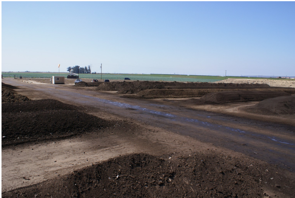
Picture: Engle and Grey Compost facility in Santa Maria

seeded with native seeds, can do to protect sub-soils, by turning them into healthy soils capable of supporting new native plant growth. Can your landfill leachate do this!?