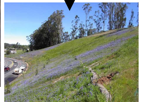
Picture: Erosion control measures